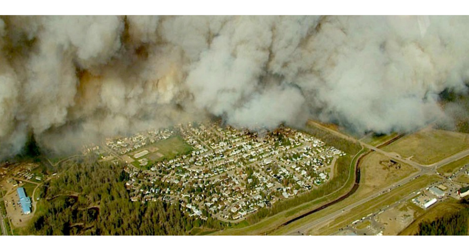
Increasing situational awareness when a wildfire threatens your community